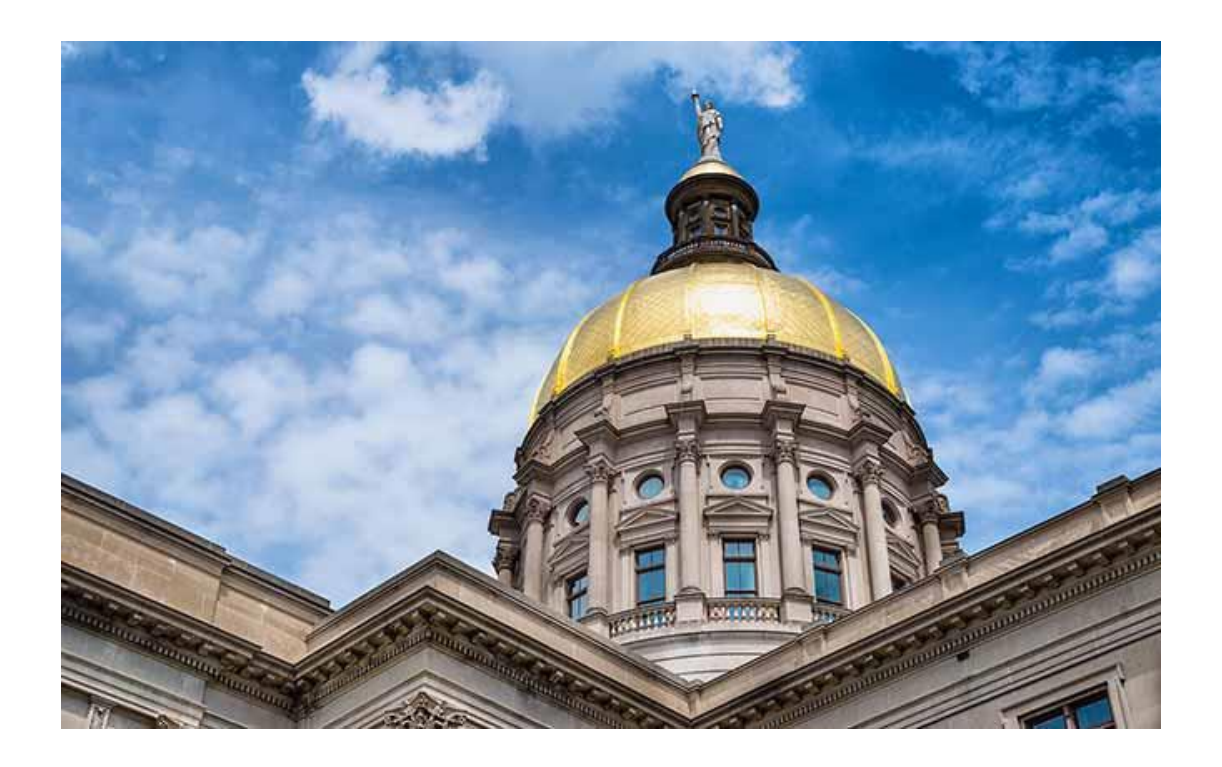
April 7, 2025 Gold Dome Report - Legislative Day 40 (Sine Die)