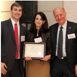
Legal Services Corporation recognized Nelson Mullins for its pro bono work in Charleston, S.C. January 2016